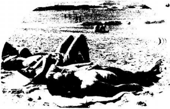
MORNING AFTER -----