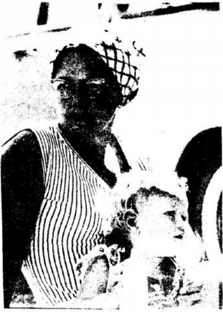
SCOTTIE'S PRIDE + JOY.